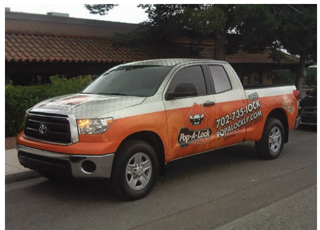
Pop-A-Lock Las Vegas has picked up new business rekeying foreclosed homes, and by offering roadside assistance.

“Working with ALOA, we have been able to create more awareness around the scammer locksmiths out there, and more proac-